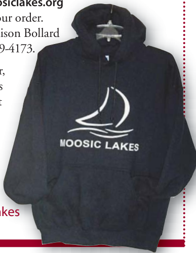
Moosic Lakes hoodie.

Remember, these items make great winter holiday presents!