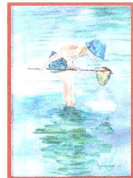
"If people concentrated on the really important things in life, there would be a shortage of fishing poles" - Doug Larson

Seasons are about to change so get out and enjoy the the commons this Fall!