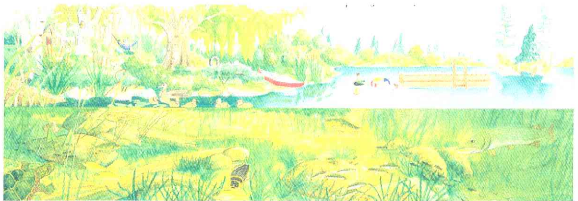
A lake's ecosystem is interdependent on the land use and actions of those in the watershed that surround it.

You can also help out more importantly around your home. Living a sustainable lifestyle will help to balance us with the ecosystem around us. There are many ways to do this, but you can begin by reading the publication link below. Stay tuned for more info!